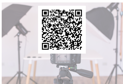
'A' Building Conference Room

If you have joined East Brent within the last year or you missed getting your church directory picture updated last year, sign up to get your picture taken in March!